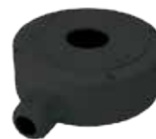
Junction Box AVM-EDMTS-G-TL1