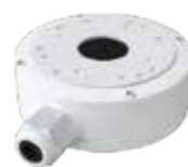
Junction Box AVM-EDMTS-W-TL1